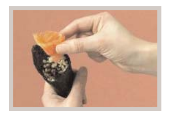
MAKES 7 APPETIZER SERVINGS, 2 ROLLS EACH.

4. To assemble hand-rolls: Roll a nori sheet into a cone, glossy side out (a small opening at the narrow end is fine). Dab the lower outside corner with water and press firmly to seal the cone. Spoon about 2 tablespoons of the rice mixture into the cone, dip a finger into water and press rice around and up to cover the inside, making a hole in the middle. Stuff the hole with 1 tablespoon salmon (see photo, below), then 1 tablespoon each of cucumber and sprouts. Top with a piece of ginger. Between cones, dip the spoon in cold water to prevent sticking. Serve immediately, with the soy sauce mixture and the remaining pickled ginger.