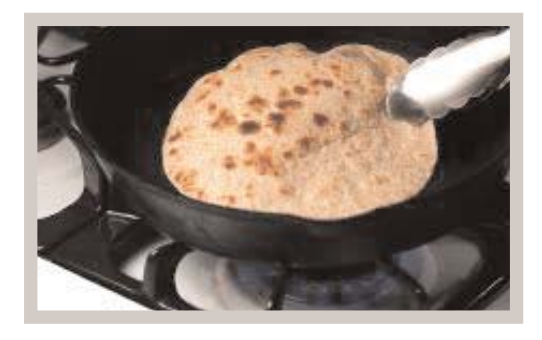
MAKES 8 TORTILLAS.

PER TORTILLA: 147 CALORIES; 6 G TOTAL FAT (0 G SAT, 3 G MONO); 0 MG CHOLESTEROL; 21 G CARBOHYDRATE; 4 G PROTEIN; 2 G FIBER; 147 MG SODIUM.